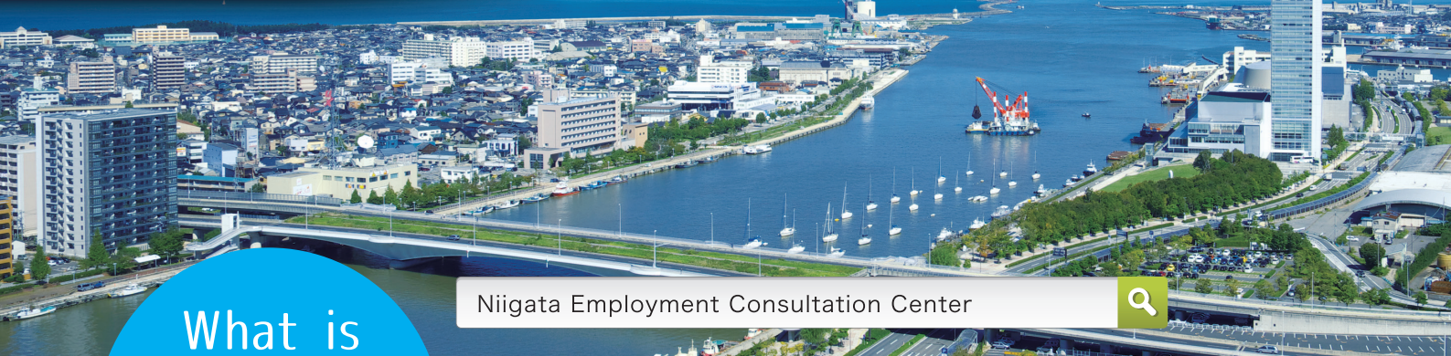
Niigata Employment Consultation Center